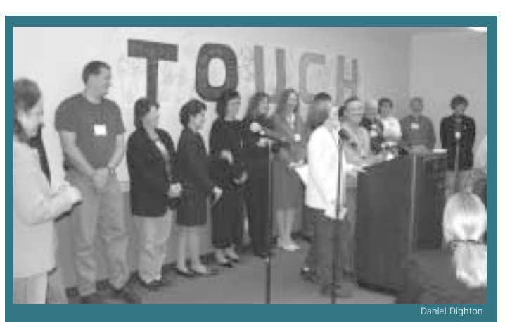
The serious and hard work at the BARJ summit ended on a light note, with some creative presentations from the different regional groups. Above, the Northern Region group makes their presentation to the participants.

It is the workgroup discussions around these three questions that will serve as the foundation for the development of a strategic plan for the state-