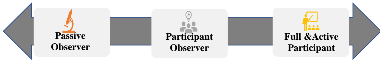
Figure 2 The Continuum of Researcher Participation in Field Observations